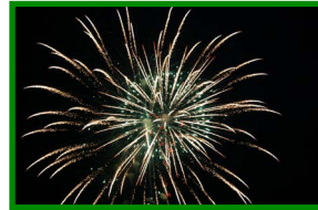
Fireworks